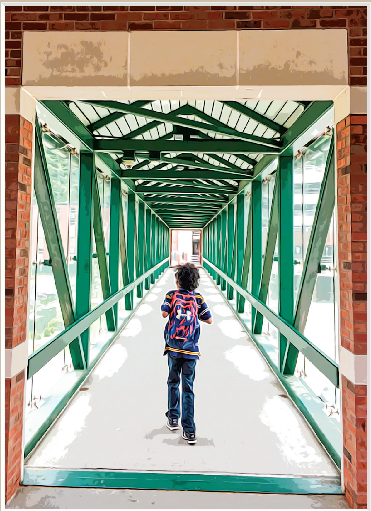
A Young Eisner Scholar in rural North Carolina walks to a study session.