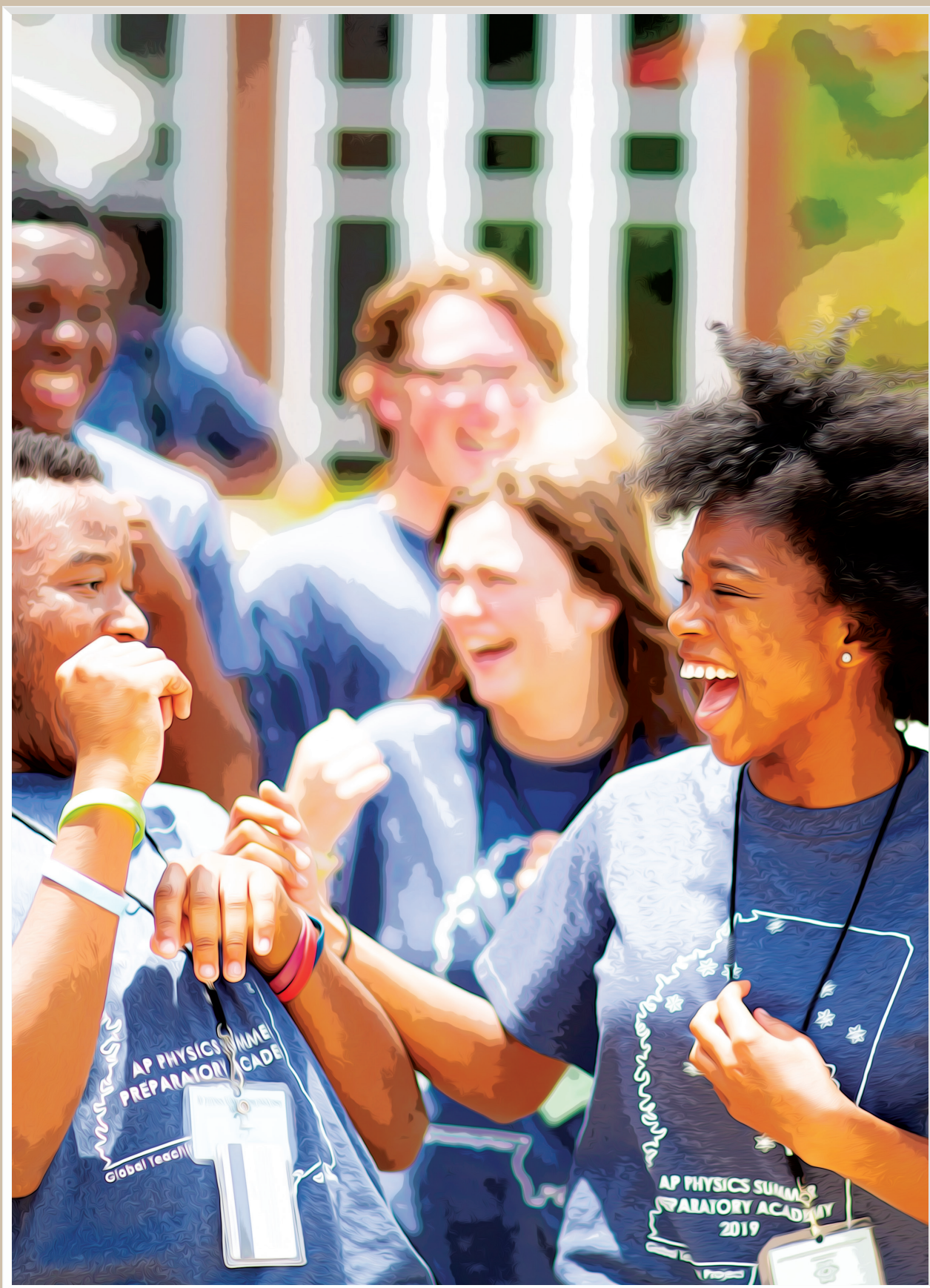
AP Physics students in Mississippi interact during a summer academy.