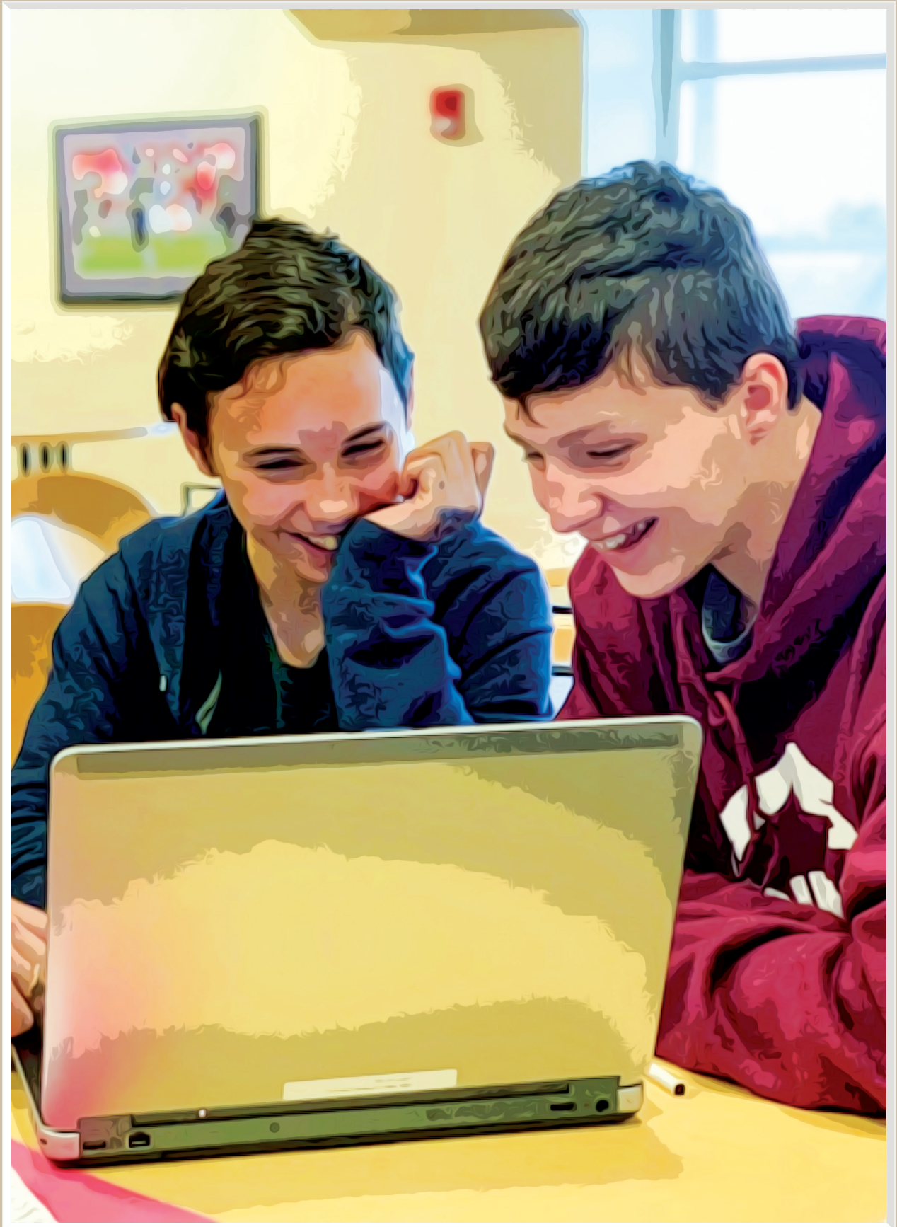
High school students from James Madison University's Valley Scholars Program engage in a lesson.