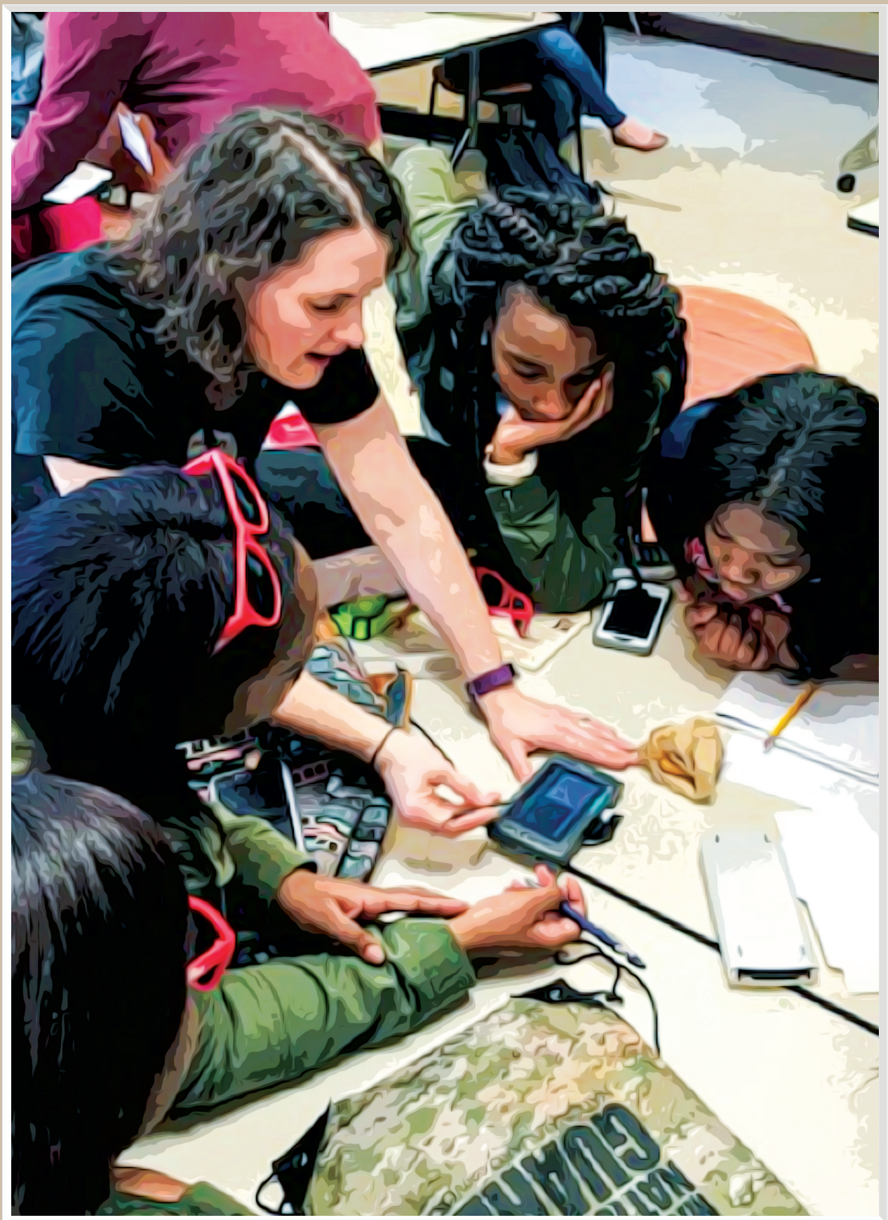
Faculty in the Mississippi Public School Consortium for Educational Access program assist students with an AP physics experiment.