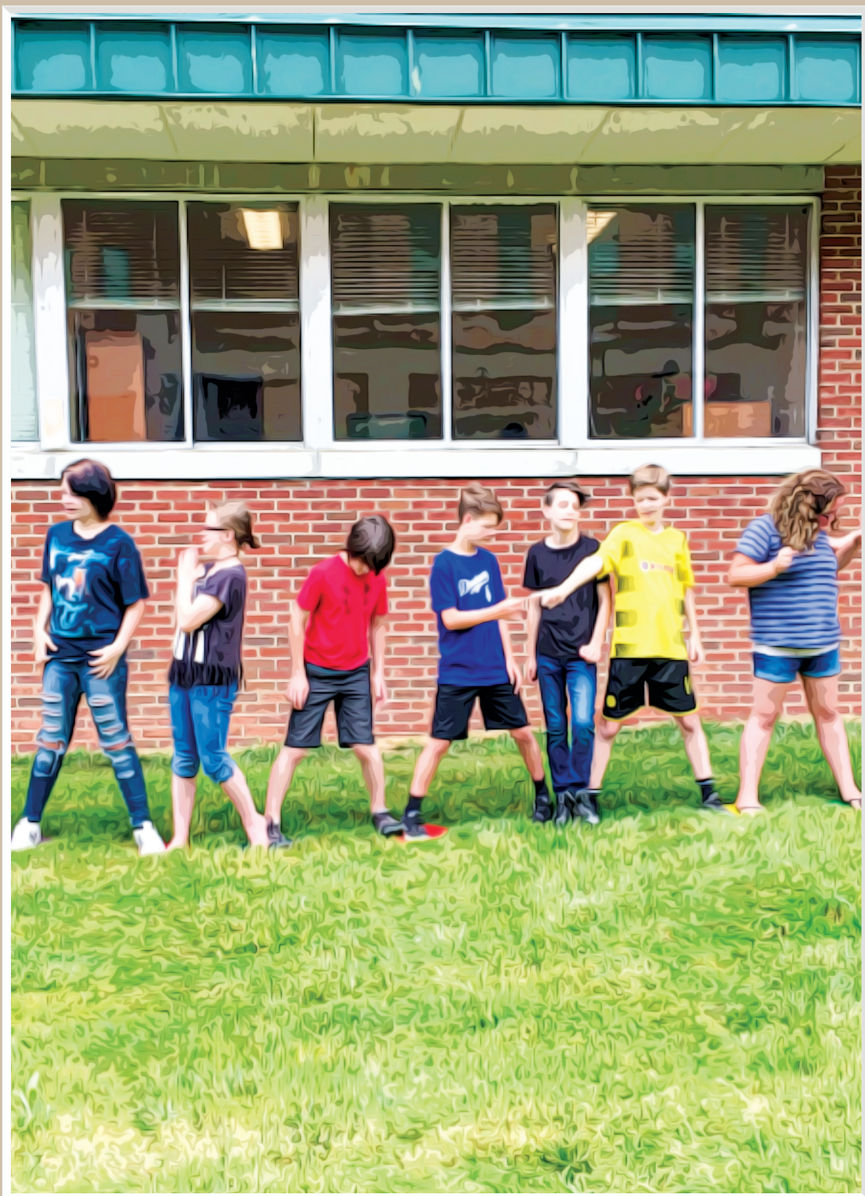
Young Eisner Scholars in rural North Carolina line up before engaging in an organization-led activity.